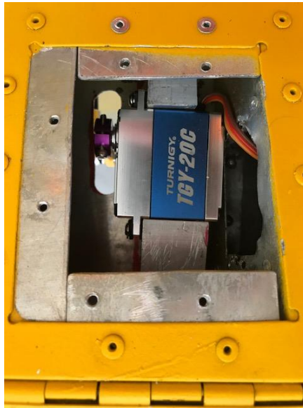
H5 trim tab servo mounted to 2 square aluminum tubing pieces with wooden dowel glued inside. These are then riveted to the control surface from underneath