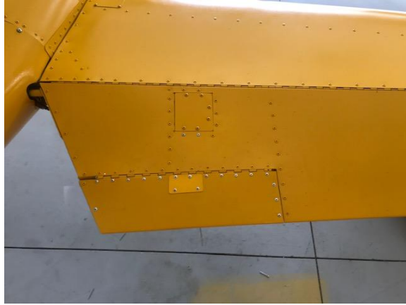
H5 trim tab with servo access panel on elevator control surface