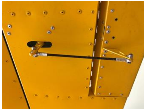
Slot allows the servo arm to come out and connect via a control rod to the trim tab horn.