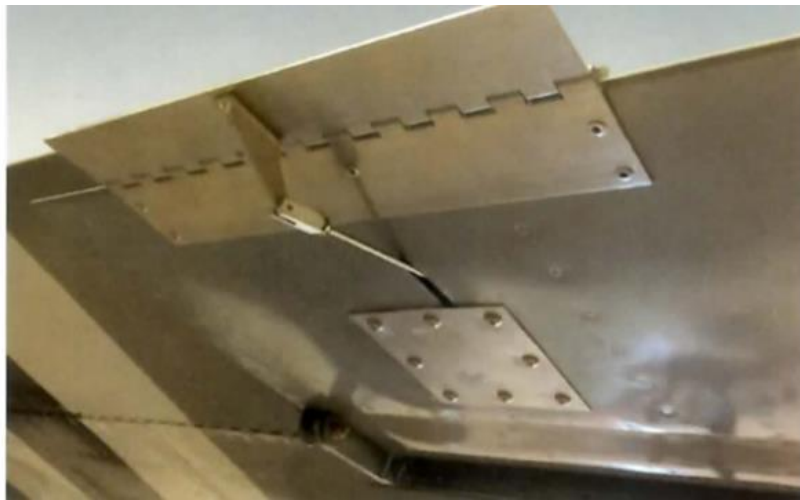
Another example of a trim tab riveted to the trailing edge of a control surface with servo control rod and horn

If there is not sufficient room inside the control surface, it is also possible to mount the servo on the outside.